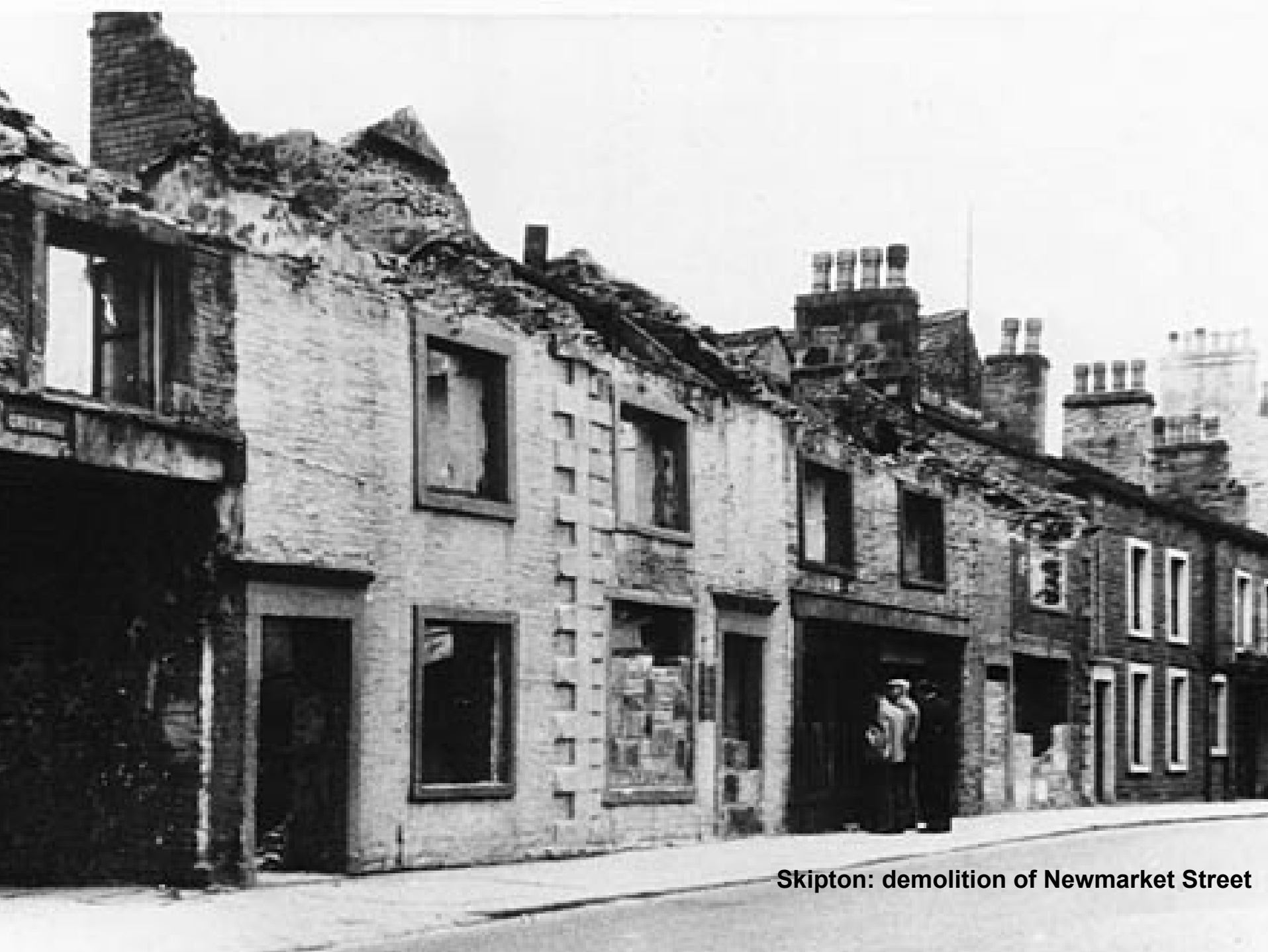
Skipton: demolition of Newmarket Street