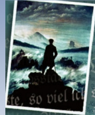
Kafka – kritische S. Fischer Ausgabe