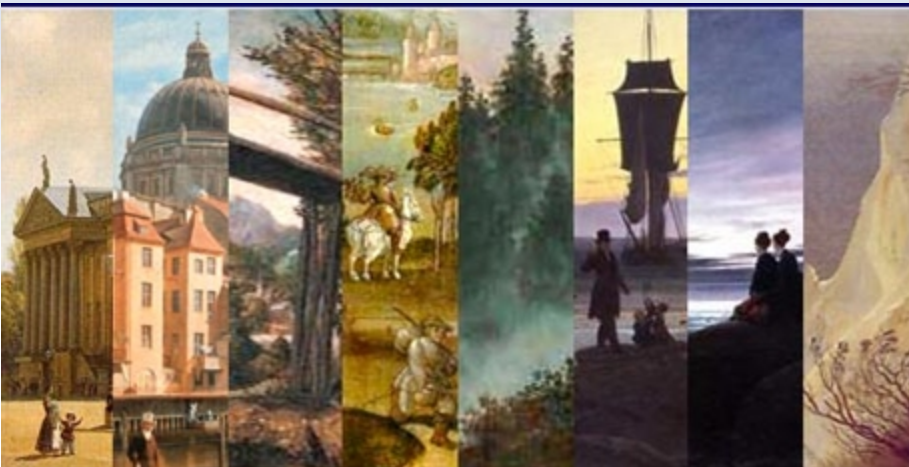
Digitale Bibliothek Deutscher Klassiker